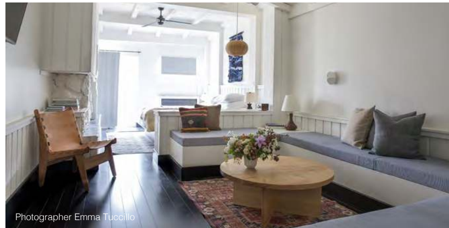
Photographer Emma Tuccillo